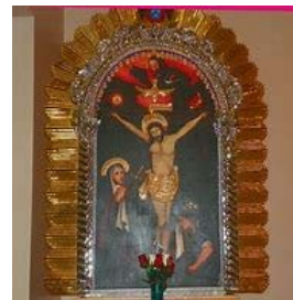
Señor de los Milagros – Christ of the Miracles