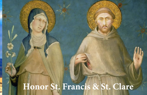
Honor St. Francis & St. Clare